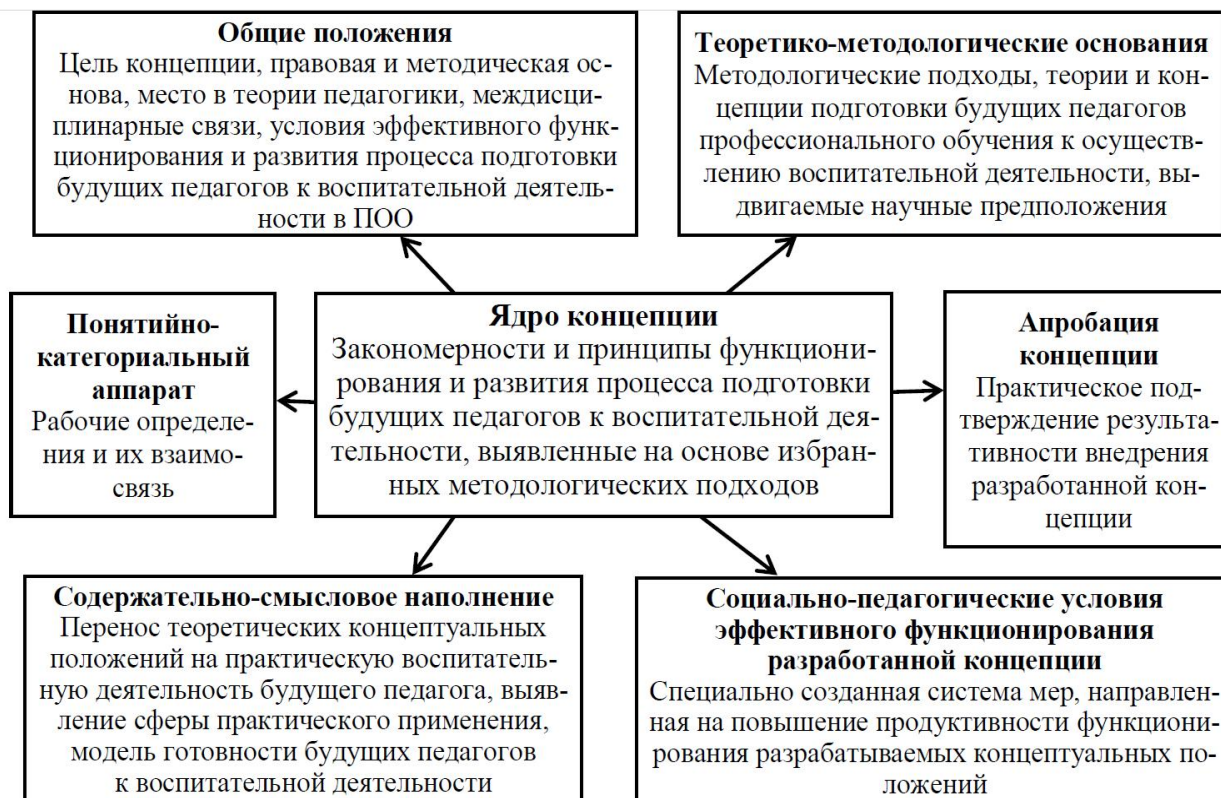
Fig. 1. The structure of the concept of training future teachers of professional education to carry out educational activities

The methodological foundations of the concept at the philosophical level were the anthropological approach, the theory of axiological ontology and the spatial approach. The systematic and axiological approaches were chosen as the general scientific basis of the research. The theoretical and methodological research strategy was based on nuclear and contextual approaches. The practice-oriented approach was used as a practice-oriented basis.