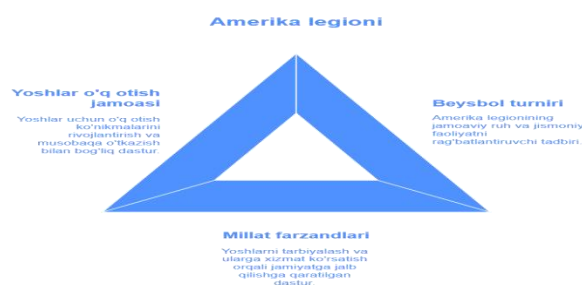
Figure 2.1. Major projects of the American Legion organization

In the USA military to the servants given wide financial, medical and education benefits youth between military-patriotism feelings develops. With this together, two step by step military-patriotism programs of the youth abilities to form service War veterans support and former the military financial provider organizations military-patriotism movement main engine is considered.